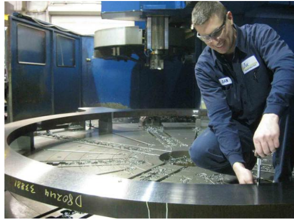
Using a micrometer for precision - Zak, Inc.

Given the need to bring more people into the workforce, it seems logical that efforts should be made to encourage participation by the unemployed, the underemployed, the displaced, and the discouraged.