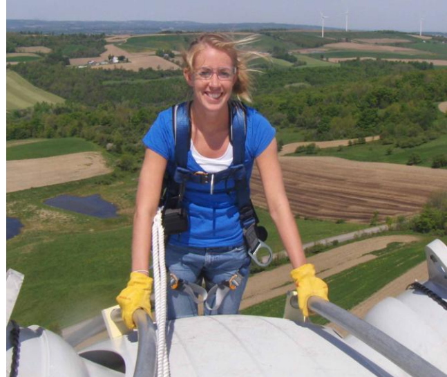
GE Wind Energy Learning Center employee, 250 feet in the air servicing a GE 1.5 MW Wind Turbine.