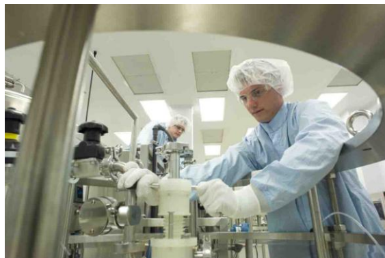
Technician making adjustments at Regeneron Pharmaceuticals, Inc.