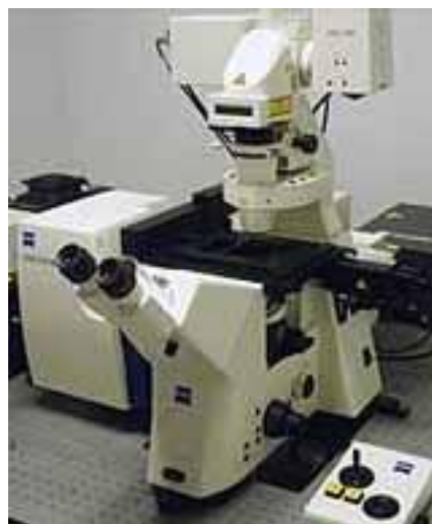
Something you might see on Sci-Fi: Optical Tweezers, from RPI Biotech lab.

Employers have mixed views on how to best use community college resources in their businesses, due to the cost, varying levels of responsiveness, and ease of access. Some colleges lean toward preparing transfers to four-year colleges, while others concentrate on “terminal” two-year degree programs. While recent changes have sped up the State’s program approval process, making it easier for colleges to respond to employer requests in a quicker manner, the credit and non-credit sides often do not communicate or coordinate their efforts. There is also little communication between colleges, according to college administrators.