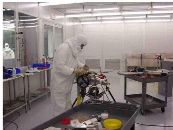
Orbital welding stainless steel tubing for a high purity gas delivery system by a TFS technician